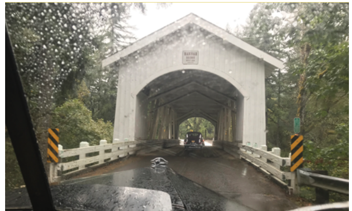
Crossing the covered Hannah Bridge, built in 1936.

Model A and Ts, the usual muscle cars, vintage pickups, and sports cars. They kept coming in as the day progressed and the rain ceased. All together about 100 cars, a nice turnout, considering the weather. There were also arts and crafts vendors, and the chicken barbeque that couldn't be beat. By the time we got back out to the car, the sun was peeking through. Pat and I decided to turn our cruise into a wine tour and headed for the Chehalem Mountains. Even if it was damp, it was a nice day to take the Packard out for a drive.