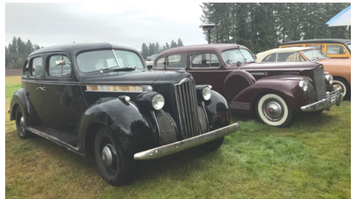
The Munsch 110 sedan looks great wet. Chris Cataldo's 1941 160 Touring Sedan looks great in any weather.