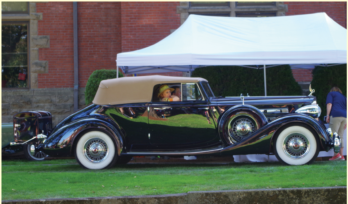
ALLEN C. STEPHENS ELEGANCE AWARD Sponsored by: The Stephens Family