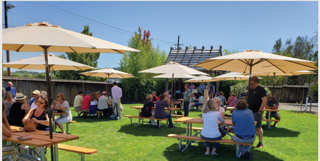
Picnic games at Sake One

After lunch and more mutual admiration discussions, we set off for our next destination which was the Sake' One Company. Another lovely drive got us there as the day warmed up a bit. This place is not referred to as a brewery, or distillery or even a winery. Technically, Sake is really none of those things. It rather stands alone. Made from rice, water, a fungus called Koji, and yeast, it's a unique beverage that tastes like nothing else.