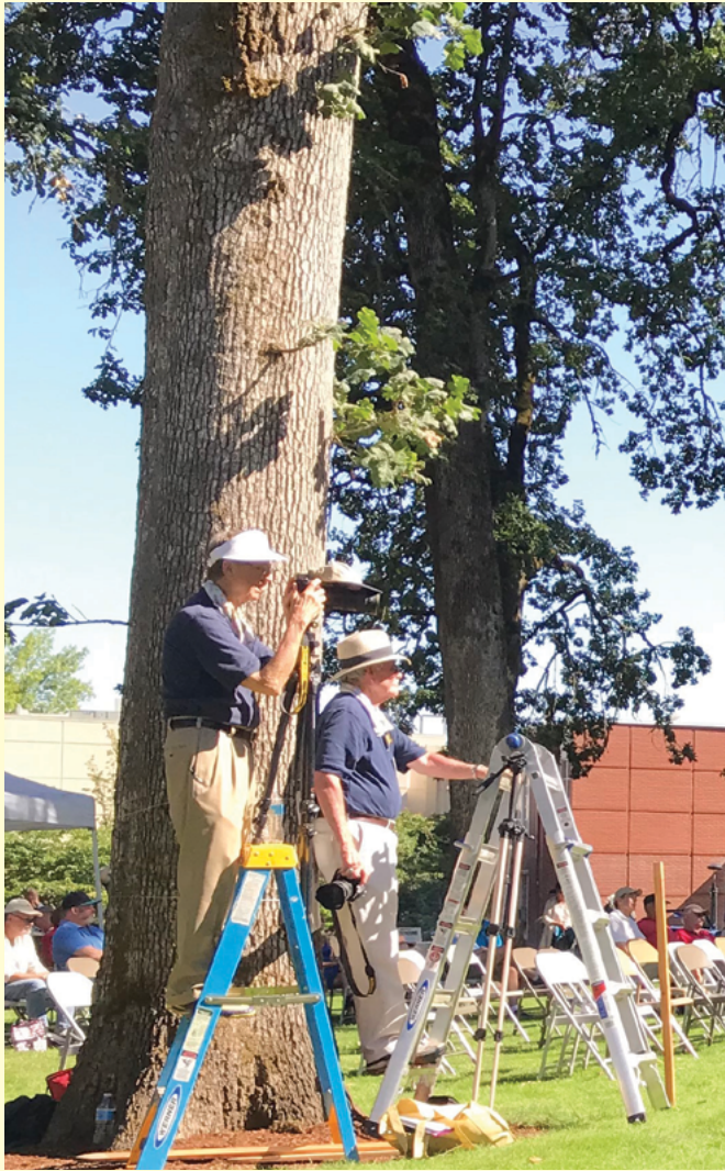
Official stage photographers