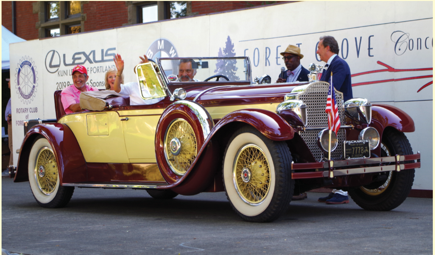
ROTARY PRESIDENT'S AWARD Sponsored by: Rotary Club of Forest Grove