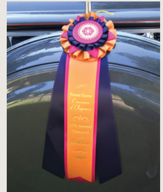
17th Vineyard & Road Tour Ribbon

“The best part of having a collector car is standing around and talking about it. The second-best part is actually driving it.” I’d have to agree with him on that, although one could debate over which is his or her first or second choice.