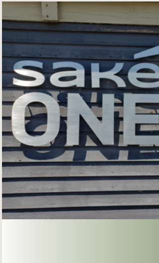
Rice wine is wine, too.