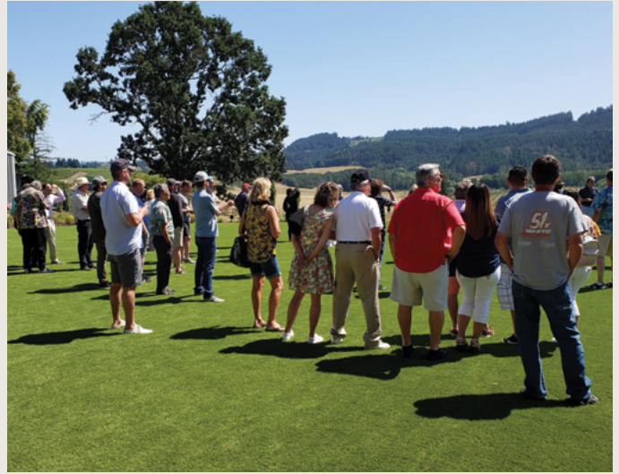
Awards presentation at Abbey Road